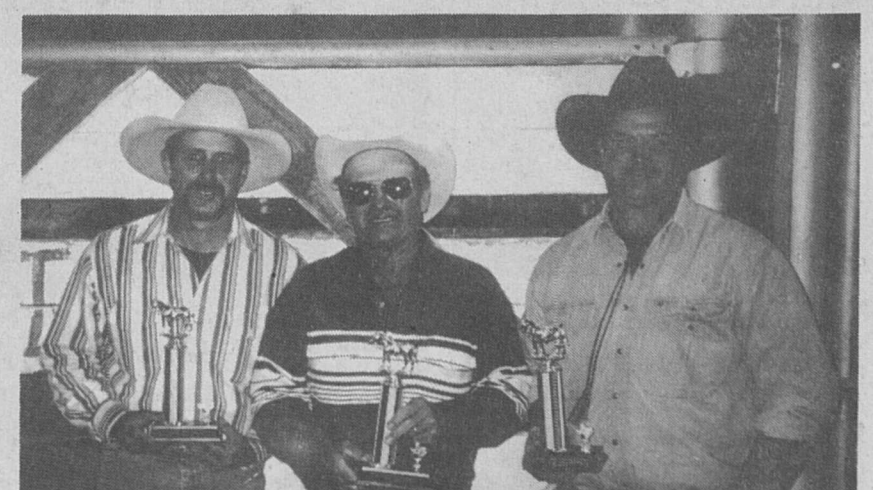
Go Texan team penning

reclamation district that generates electricity, manages the waters of the Texas Colorado River, operates parks, and assists communities in economic development. The LCRA operates on revenues from the sale of electricity and water and other services it provides. It cannot levy taxes and receives no tax money.